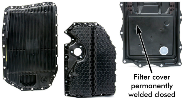
Filter cover permanently welded closed

The molded plastic engine and transmission pans found on many late-model European cars often fail after minor impacts, and may contain irreplaceable integrated fluid filters.